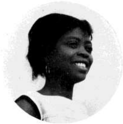
ABOVE: The warm smile of this Ghanaian girl conjures up all the sunshine of her native land BELOW: A modern school on the Cape Coast, Ghana

Television is coming to Ghana, and with its arrival one of the most significant developments of the twentieth century will enter the lives of the people in this progressive African country. The contract for the installation of the service has been given to Marconi's, the largest single contract ever awarded to us in the broadcasting field. It involves not only a comprehensive new television service, but additions to the existing sound broadcasting system at Tema also installed by Marconi's and opened just over a year ago. As at Tema, we will hand over the entire television service as a going concern.