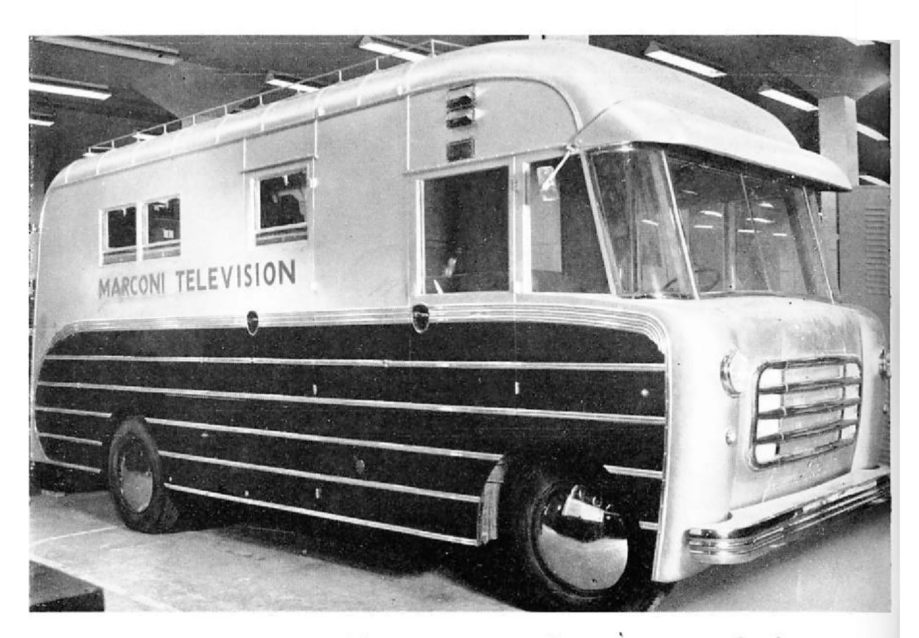
The TV mobile unit van which will be sent overseas to Caracas very soon. On the next page you can see inside. In the foreground is the producer's control desk. The sound mixer is on his left and the mains voltage regulator unit on his right. Beyond are the camera control and the vision mixer units