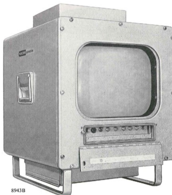
Type V 4260 Dustproof Monitor Housing.