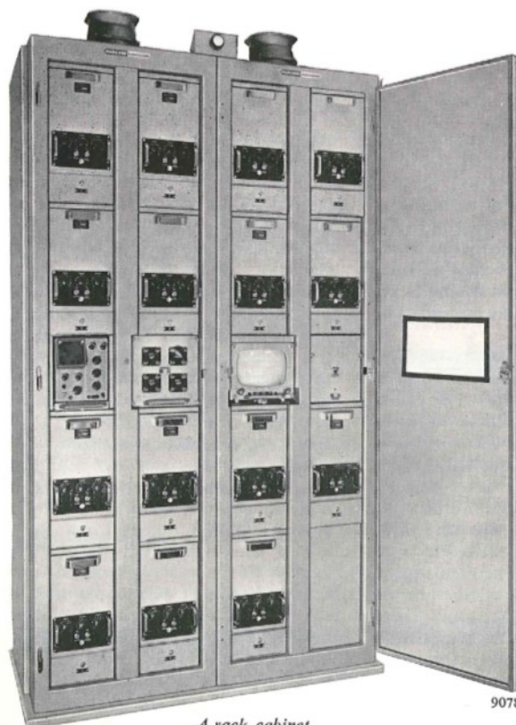
A rack cabinet.

Extract fan: Weight: 10 lb. (4.5 kg). Power supplies: 200–250 V, 50 c/s. 75 VA.