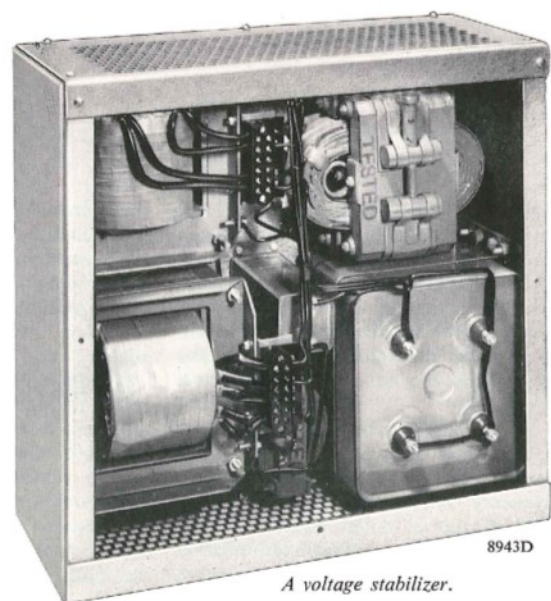
A voltage stabilizer.