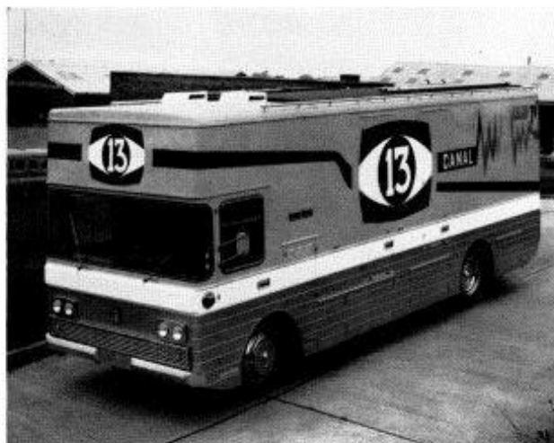
Type B 4401 television outside broadcast unit for 'Canal 13' Mexico City

Space is allocated for a comprehensive range of test equipment and the termination panel has capacity for connection to other vehicles during complex outside broadcasts. The Vision Mixer has eight inputs, so that remote sources can be used, and Special Effects equipment can be fitted.