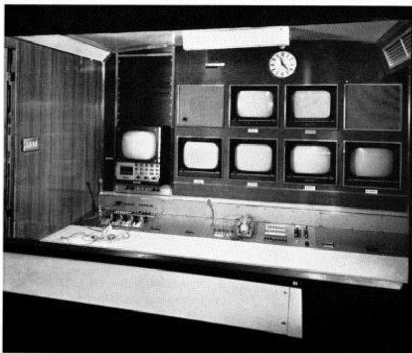
Production area of B 4401 vehicle

Keystone of this latest design is flexibility. The colour version may be equipped with a third Mark VII Camera channel, or a video tape recorder can be installed. The Mark VII channels themselves may