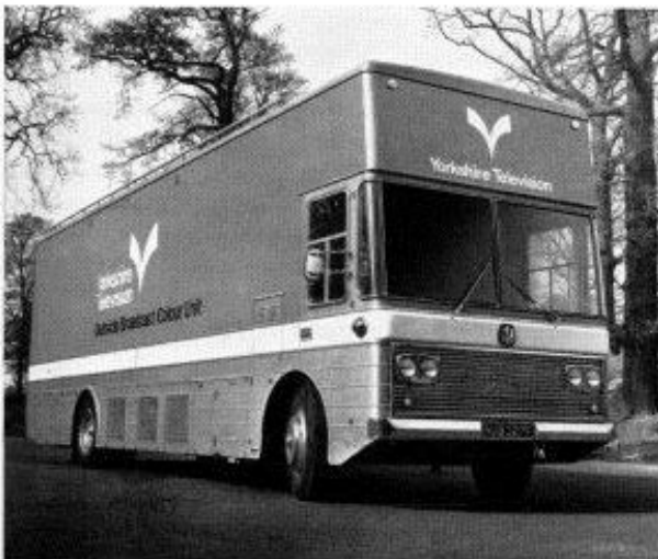
One of two Colour Units supplied to Yorkshire Television