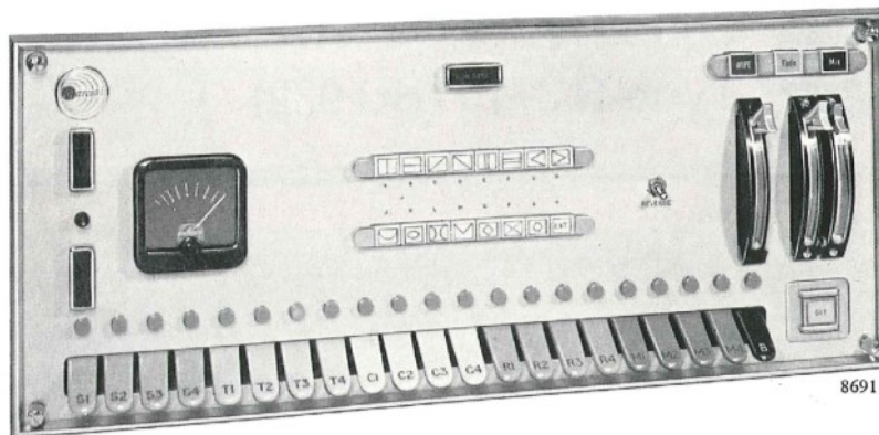
Typical presentation mixer.

In this type of control, each input circuit is selected by a 'tab' key, as shown in the illustration, which is similar to those used in organs. With this type of control, light pressure operates one contact and increased pressure overrides the first contact and operates a second contact. In this way, the first touch can be arranged to pre-select the next