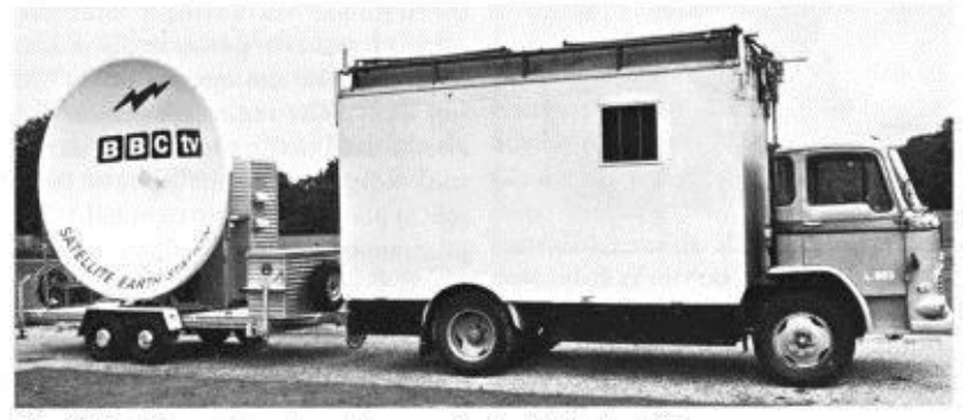
Fig. 2. Satellite earth station with a standard radio-link vehicle

island and that each programme would be linked into it. However, at the initial planning meeting it became apparent that, because of its small size, the terminal could easily be integrated with other OB vehicles on site and, as the dish elevation was 32°, the main beam was well clear of local houses