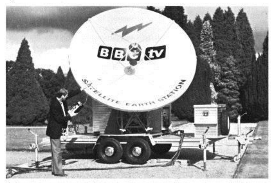
Fig. 3. Satellite earth station in use (checking stray radiation)

only tens of feet away. Power requirements are small (7kVA single-phase) and so the initial tests could be carried out before mains power was available using a small trailer-generator. The vision circuit test was conducted satisfactorily using the OTS Channel 4 spot-beam transponder to Goonhilly and a second test was conducted to confirm that Channel 2, Euro-beam to Goonhilly, was also acceptable.