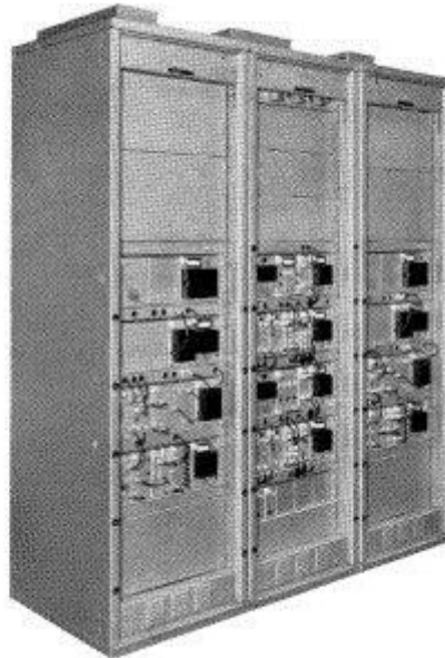
U.H.F Paralleling equipment between two B 7311 Drive transmitters

Phase comparators, operated from signals derived from the output transmission lines, are mounted on the associated combining unit system assemblies. Correction signals are then fed from the phase comparators to the B 7952 cabinet.